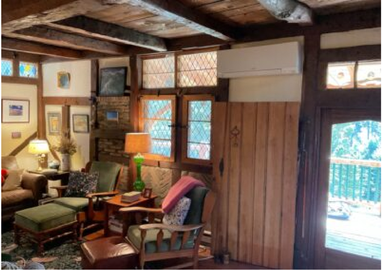
Wall Mounted Unit in Living Room