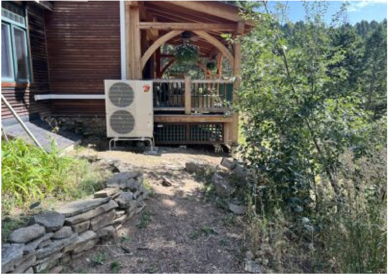
Outdoor Condenser Unit