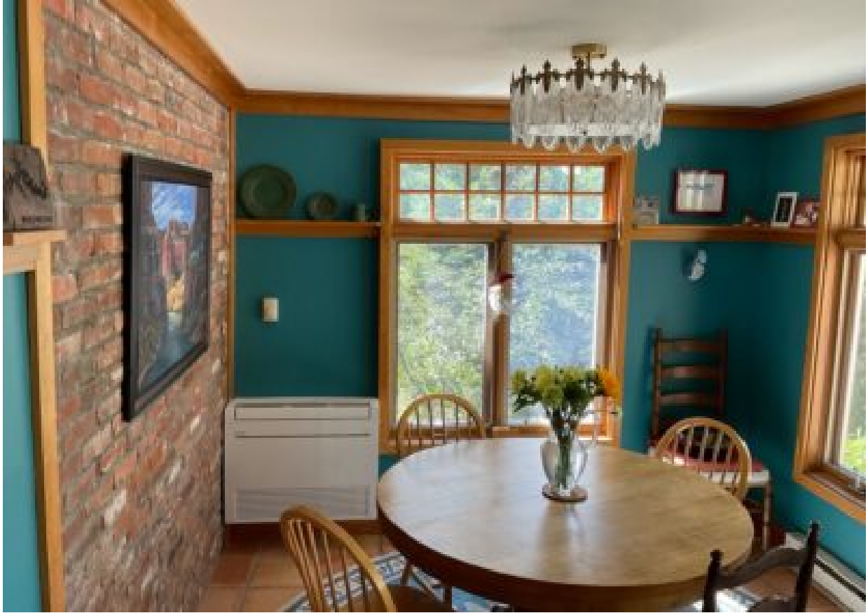
Floor Mounted Unit In Dining Room