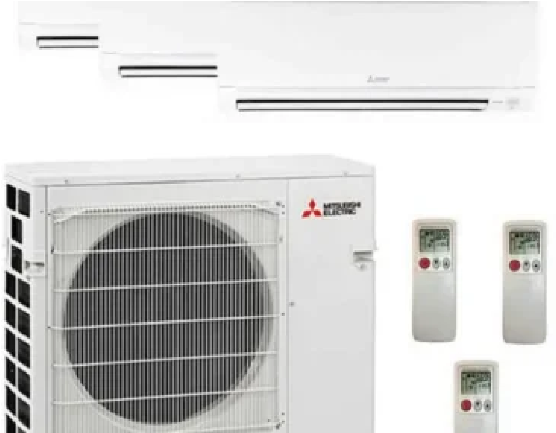
Mitsubishi 3-Zone Wall Mounted Unit